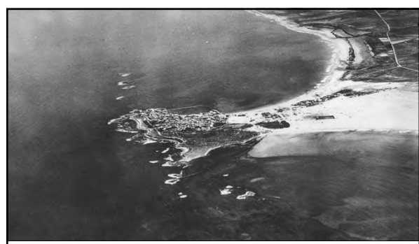
Aerial photo of Tyre made by French Air Force before 1934. File:Tyre-aerial-photo-by-France-Military-1934.jpg, (Public Domain)